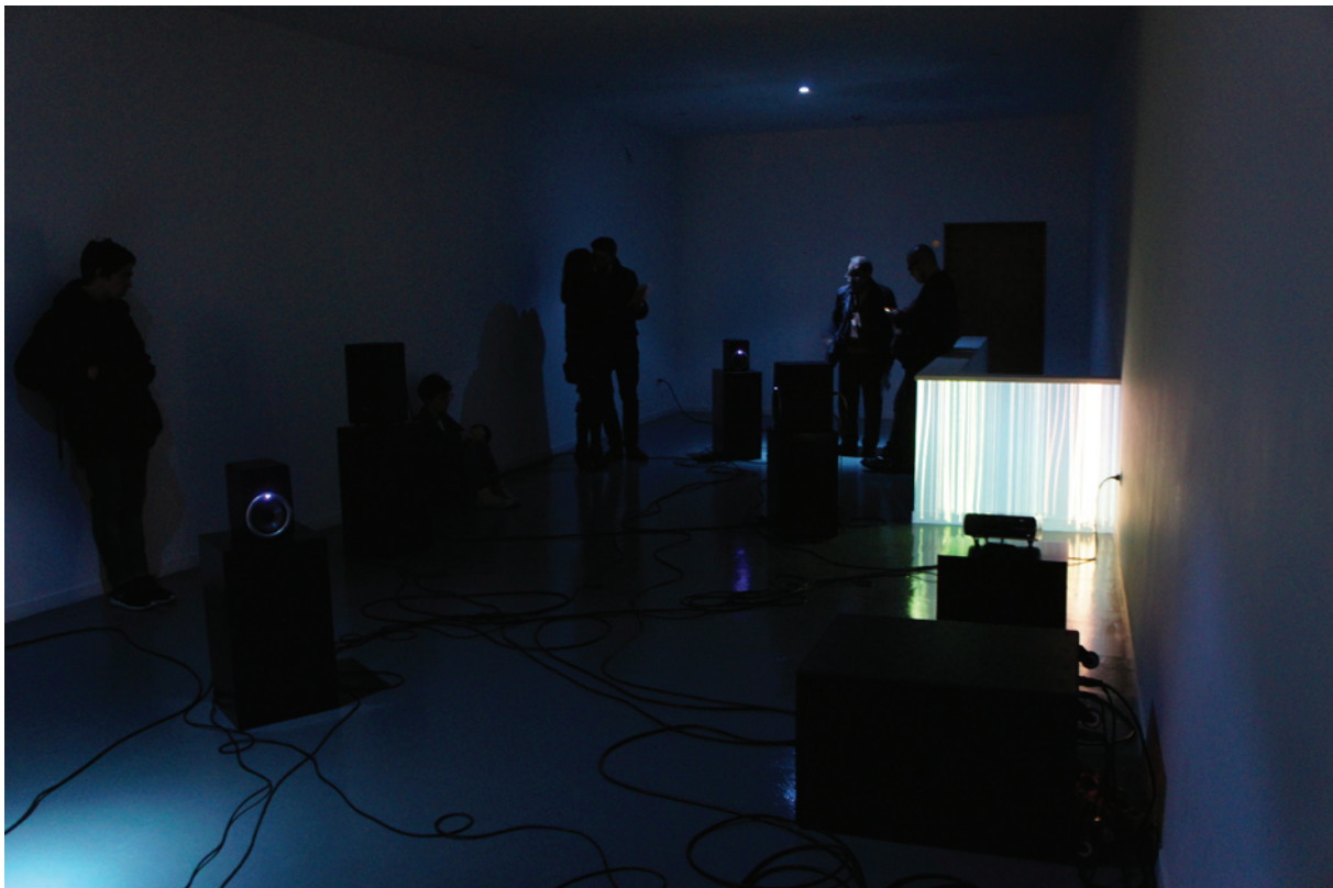
Fig. 7 View of the installation.

The system for the visual projection was prototyped in Processing and implemented in openFrameworks, communicating with the Max patch through Open Sound Control.