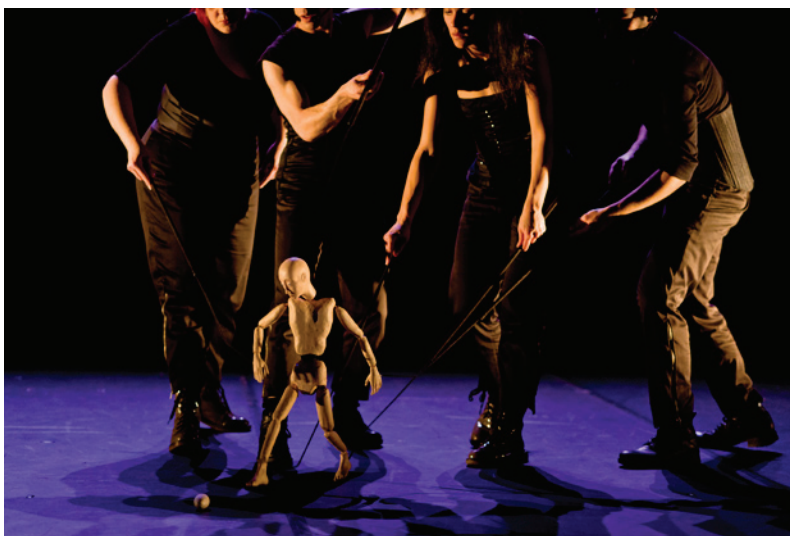
Fig.1 Scene from OVO .

Working closely with the puppets, designers and puppeteers during the development of these two works, the authors became aware of a rich sound potential to be