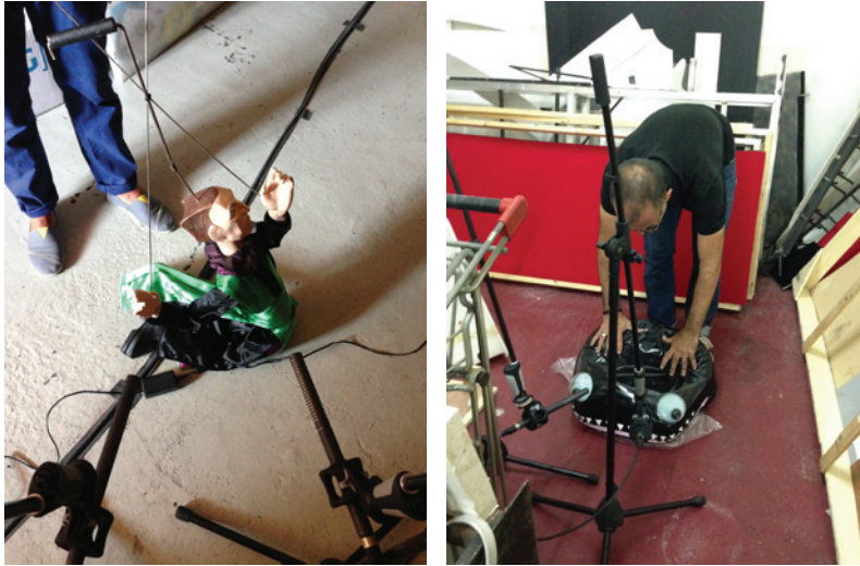
Figs. 2 & 3 Recording with puppets.

The recordings were made as 2-channel files. From the several hours of material collected, the authors prepared a selection of over 500 edits, ranging in duration from just under one second to one and a half minutes. Besides minimal equalization or denoising, no further post-production was carried out.