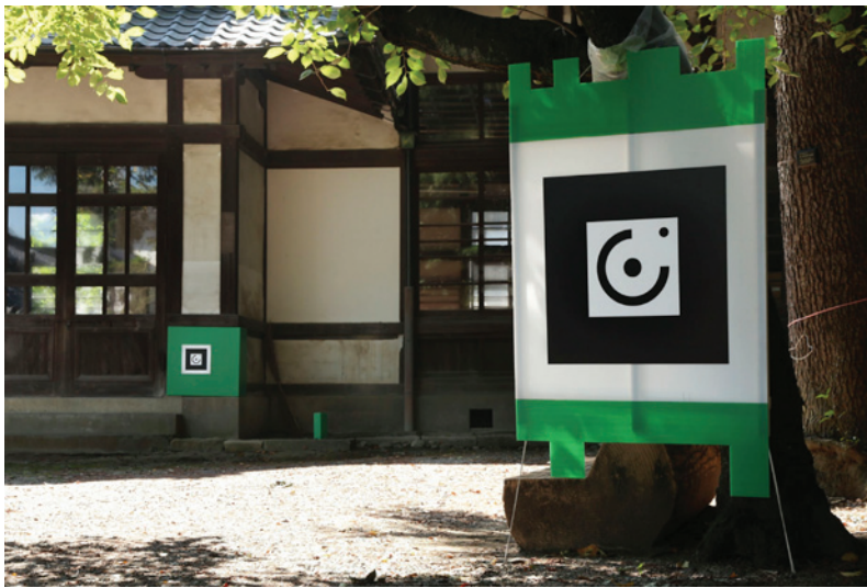
Fig. 2 noemaflux Ogaki, Japan. Troy Innocent & Indae Hwang 2010

This artificial world comprised of a set of digital entities, one located at each site. Expressed as both a computer graphic and sound, their appearance changed depending on data introduced from the previous site visited by the player. Effectively, the player carried a seed from one site to the next to initiate the process of generating the graphic and sound content. Using the metaphor of pollination, the players were playing the role of honeybees by shifting the data around within a mobile device.