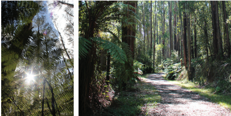
Fig. 1 Australian bushwalk

collapses the “[r]omantic ocular divide between the human appreciator and the picture-esque scene” (2011). Here the environment shifts from ‘appearance to experience’ (Ryan 2011), no longer perceived in representative, pictorial or scenic terms but instead a dynamic, embodied and multi-sensory experience.