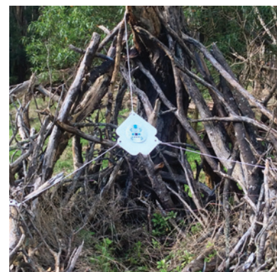
Fig. 4 Concept art for a bush AR marker in Epiphyte attached via rope

The AR Markers serve a number of purposes; redefining the space with signs to establish a crossmedia ecology; distinguishing the species within this ecology, acting as navigation landmarks to guide participants as they traverse the space and finally, as readable signs, they will also trigger changes in the on-screen content of the mobile devices carried by participants.